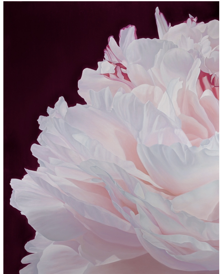
"Pale Pink Peony" by Donald Peeler